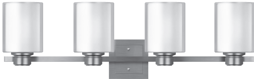
LF-2006-BL-10 35" DIMMABLE VANITY FIXTURE