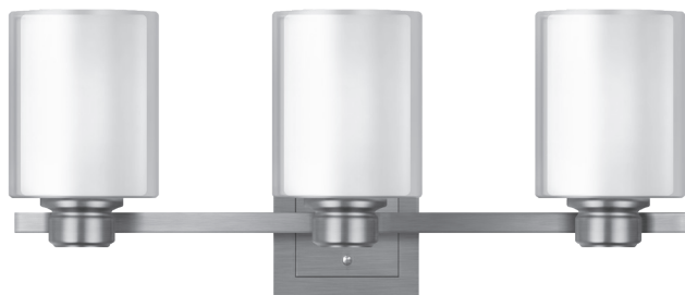
LF-2007-BL-10 25" DIMMABLE VANITY FIXTURE

Please consult your electrician for hanging fixture and wiring.