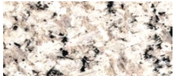
2018 Smokey White

For more information, visit us at www.wagonway.com