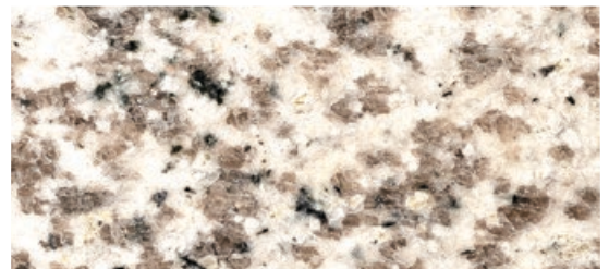
2005 Hazel White