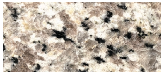
2010 Greige Slope