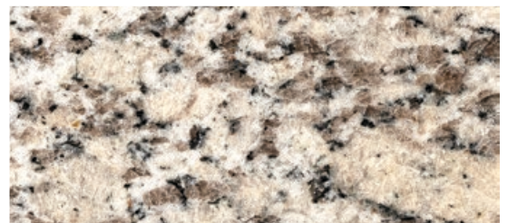
2013 Almond Summit