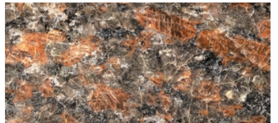
2009 Mars Red