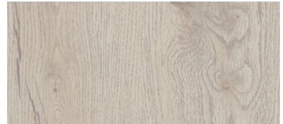
1011 White Oak