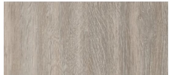
1004 Linen Oak