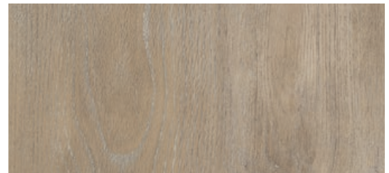
1015 Relaxed Ash