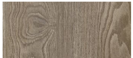
1092 Market Ash