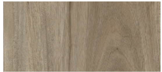
1059 Chic Ash