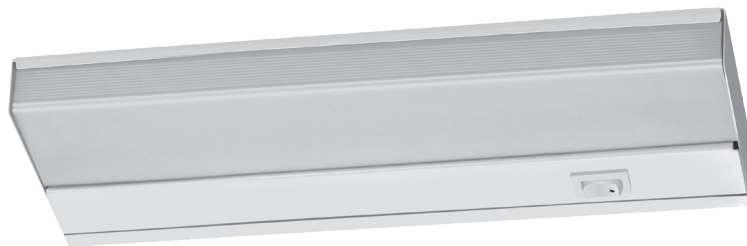
12 in. LF-2031-LED-40